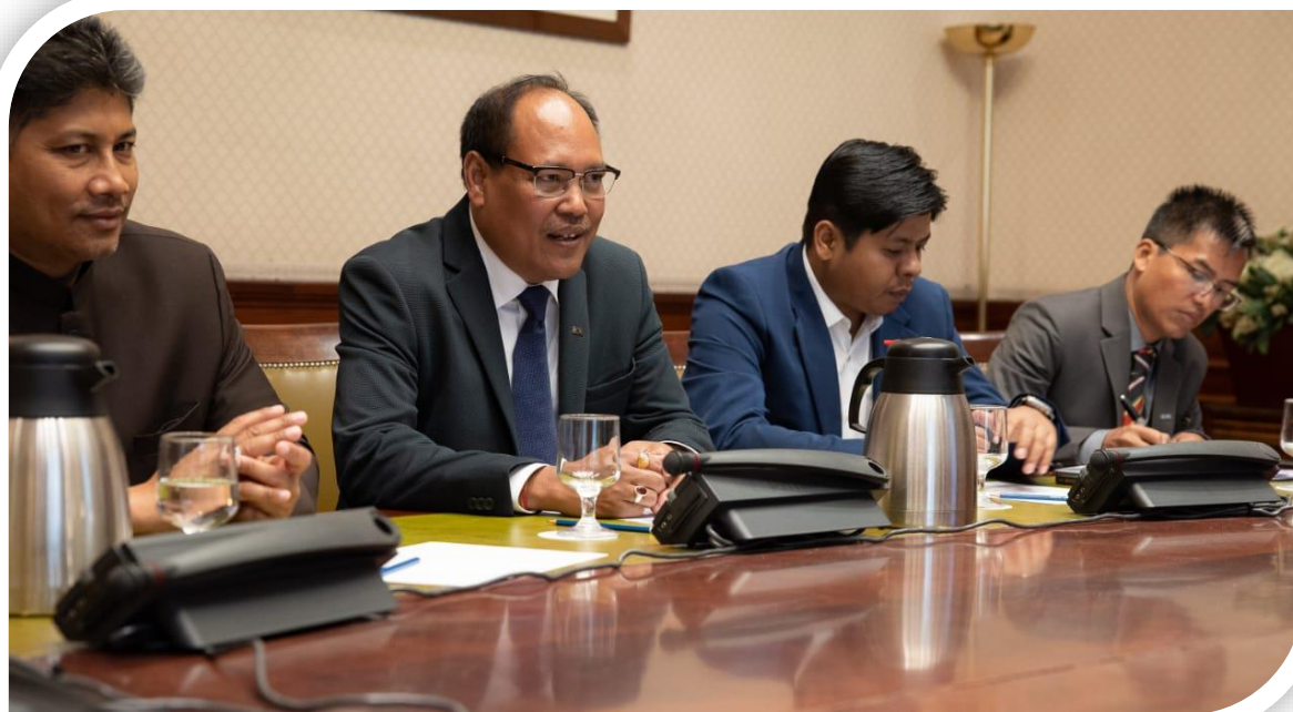
During the meeting at Congreso de los Diputados, Madrid, Spain