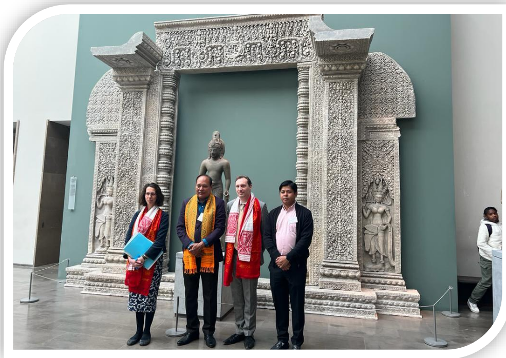
Shri Biswajit Daimary , Hon'ble Speaker, Assam and Shri Taranga Gogoi, Hon'ble MLA with officials of Guimet Museum, Paris.

The delegation was shown the Vrindavani Vastra , which is a drape woven by Assamese weavers led by Mathuradas Burha Aata during 16th century under the guidance of Srimanta Sankardeva, a great Vaishnavite saint and scholar of Assam. The Vrindavani Vastra was not on public display and specially preserved in a room but specially shown to Assam delegation due to arrangements/requests made by the Indian Embassy in Paris.