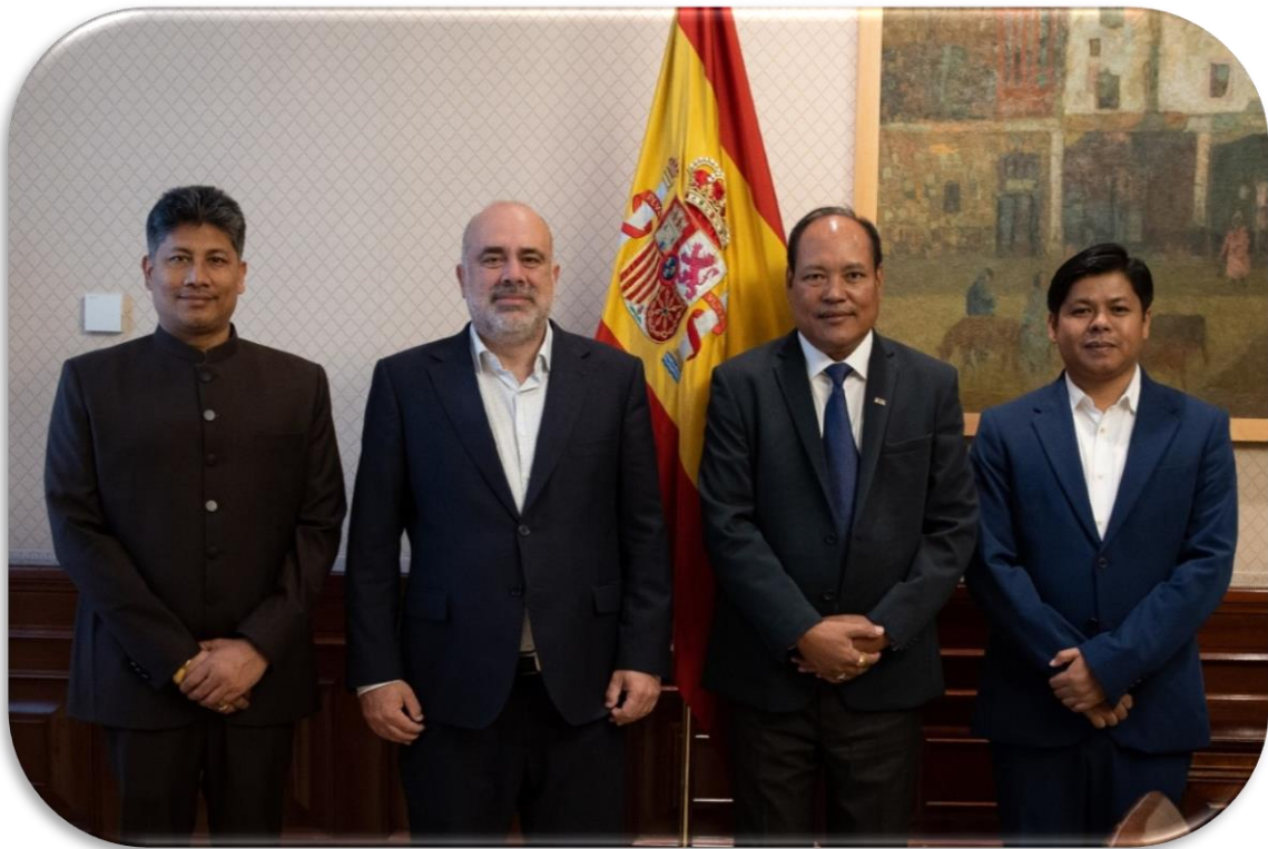
Assam Assembly delegation with Mr. Pau Mari-Klose, Chair of Foreign Affairs Committee of Congreso de los Diputados, Spain.

The delegation was informed that Spain has Autonomous Communities which are like States in India and which has the same degree of autonomy and decentralization. The delegation was also informed that there are 350 Deputies elected by constituencies (matching fifty Spanish provinces and two autonomous cities) by closed list proportional representation. Deputies serve four-year terms. The presiding officer is the President of the Congress of Deputies, who is elected by the members thereof. It is the equivalent a speaker in the Indian system. Deputies basically have the role of discussing and passing of laws. The Congreso has a session every week for three days. However there is one free week every month, therefore, there are 9 sittings of the Congreso in a month. The sessions take place during the two meeting terms: February to June and September to December.