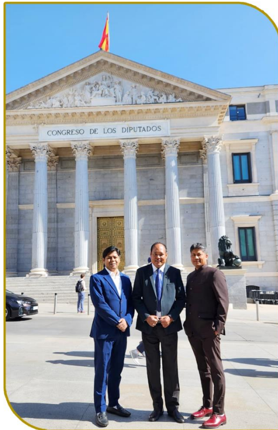
Shri Biswajit Daimary, Hon'ble Speaker, Assam with Shri Pijush Hazarika, Hon'ble Parliamentary Affairs Minister and Shri Taranga Gogoi, Hon'ble MLA in Congreso de los Diputados, Spain.

After visiting the chamber, the delegation held a meeting with the Foreign Affairs Committee of the Congreso de los Diputados. The following Members/officers participated in the meeting: