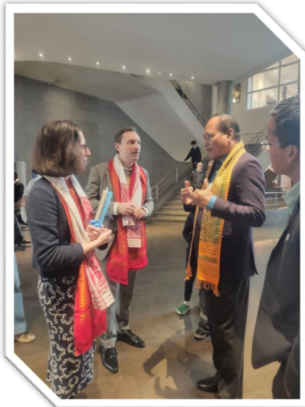
At Guimet Museum, Paris