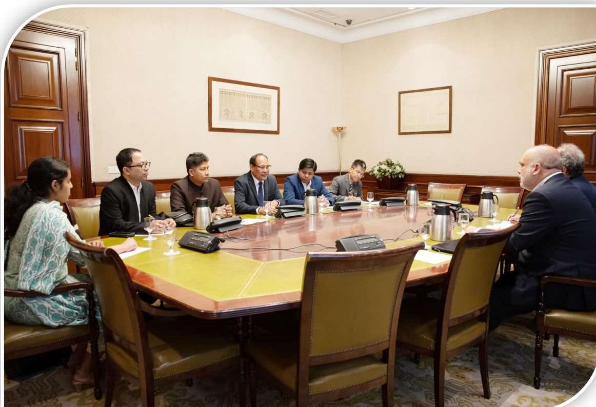
Meeting of the Assam Assembly Delegates with the Foreign Affaris Committee of Congreso de los Diputados