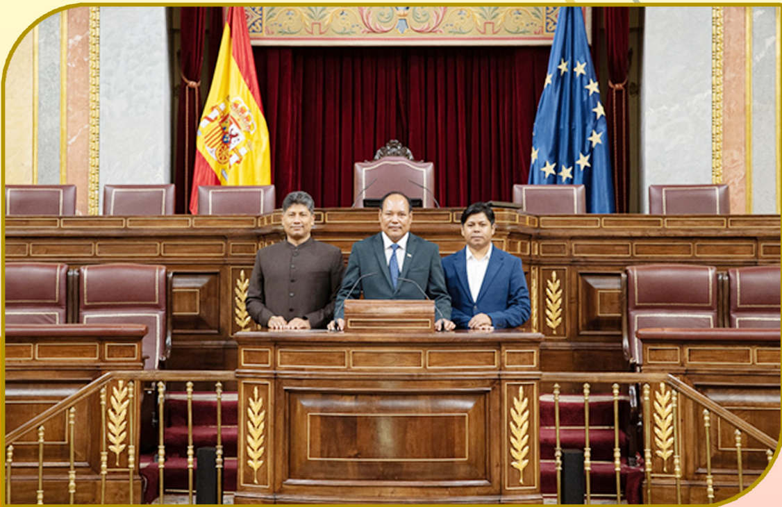
Assam Assembly delegation at Spanish Parliament