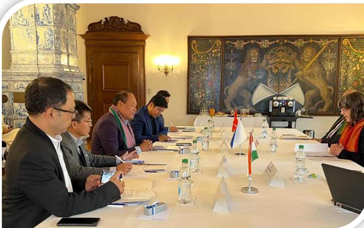
During the meeting at Zurich Cantonal Parliament, Zurich