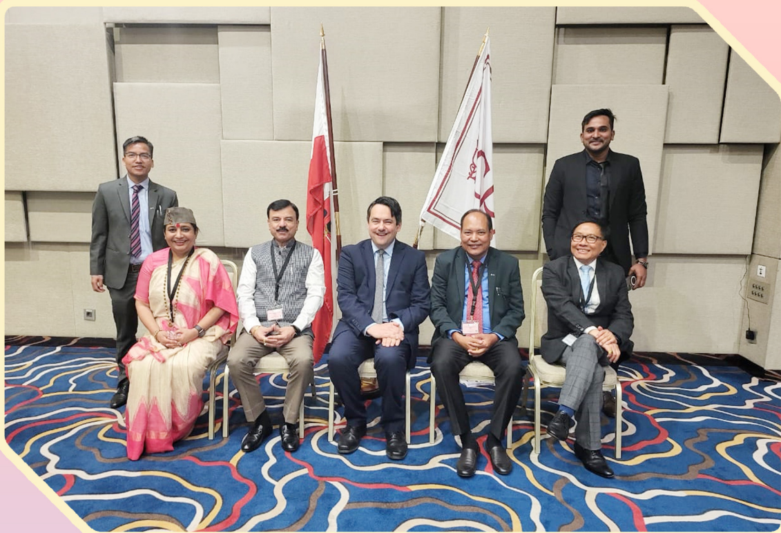
Indian delegation at CPA ExCo Meeting, Gibraltar