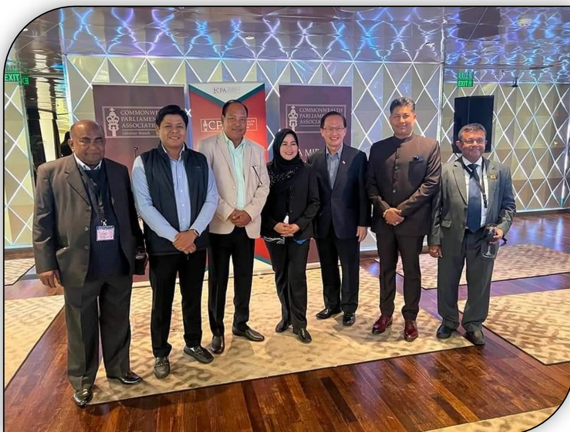
Assam Legislative Assembly Delegation with delegates from other countries at the reception programme