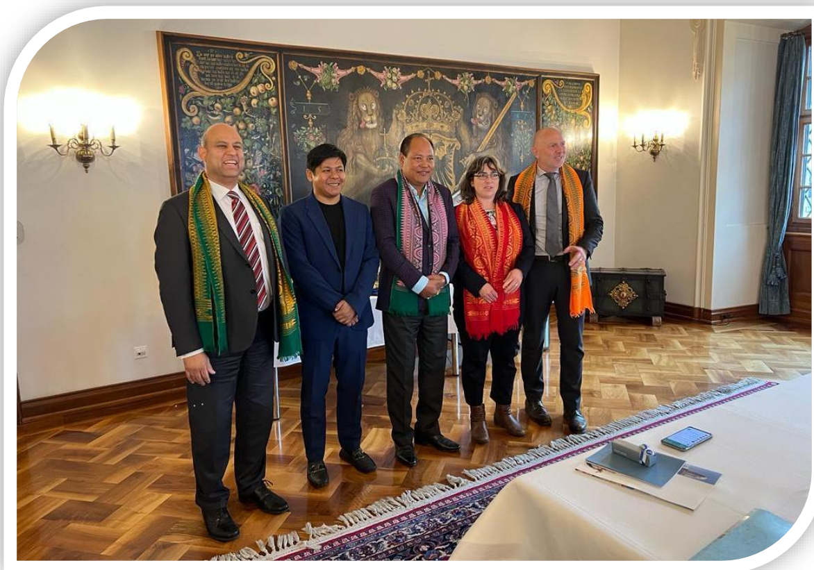
Shri Biswajit Daimary, Hon'ble Speaker, Assam and Shri Taranga Gogoi , Hon'ble MLA with the Members of Zurich Parliament.

Shri Biswajit Daimary, Hon'ble Speaker, Assam Legislative Assembly and Shri Taranga Gogoi, Hon'ble MLA visited the Zurich Cantonal Parliament on 28 th April, 2023 and had discussion on the practices and procedures of the Zurich Cantonal Parliament, its relationship with the Federal Government, the system of government in Switzerland, etc. The following are present during the meeting:-