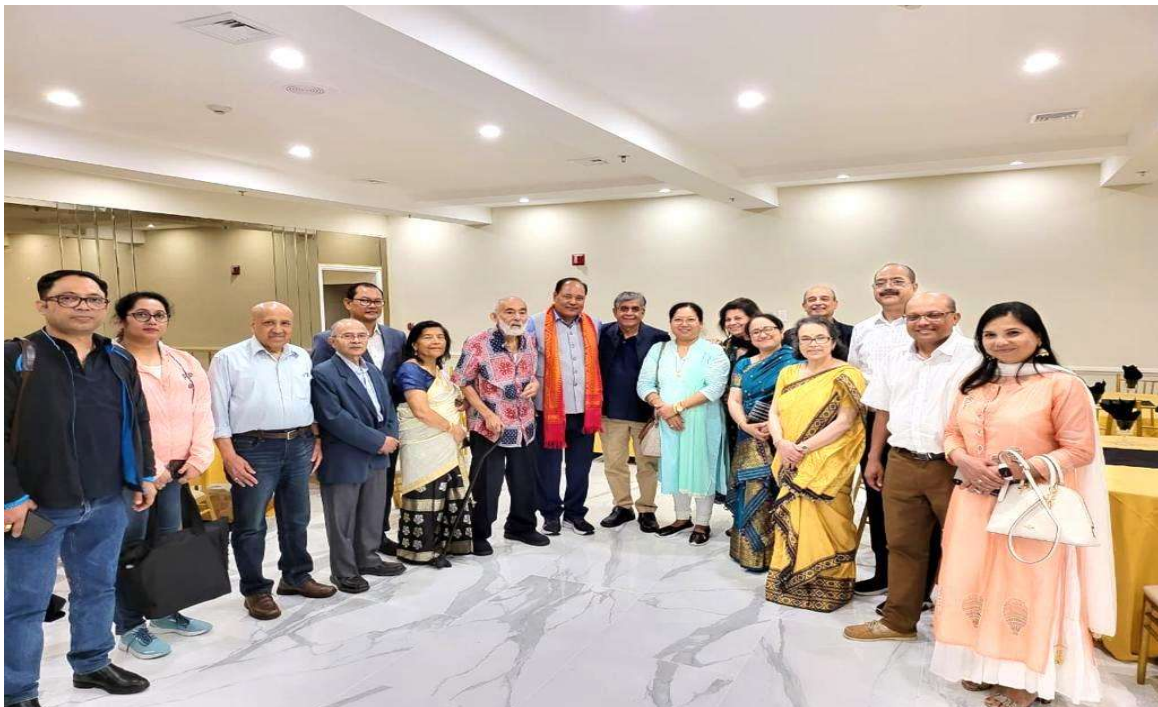
Exchange program organised by the Assamese Community at New Jersey

An Exchange Program was organized by the Assamese Community settled in New Jersey in honor of the Hon'ble Speaker, Assam and the team, which was followed by dinner. The Hon'ble Speaker briefed the gathering about the participation of the Assam Assembly delegation in the 65 th CPC. A detailed observation was made regarding the health sector and mainly the steps taken by the Government of Assam to tackle the COVID pandemic and special initiatives undertaken by the Hon'ble Chief Minister, Assam. The Assamese diaspora community widely appreciated the efforts of Assam Government during the pandemic. The Hon'ble Speaker and the Hon'ble Deputy Speaker further briefed the gathering about the various steps undertaken by the present Government of Assam to improvise the overall connectivity including the road, bridge, etc even in interior and rural areas across the State of Assam. The Assamese Community highly appreciated the endeavors of the Government of Assam.