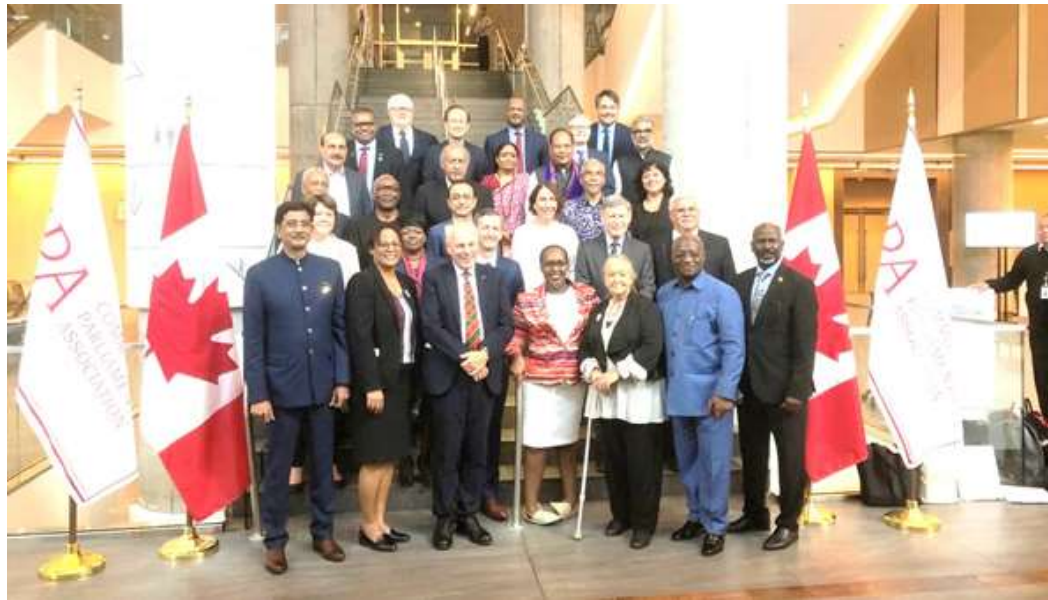
Group Photo at Conference Venue, Halifax, Canada