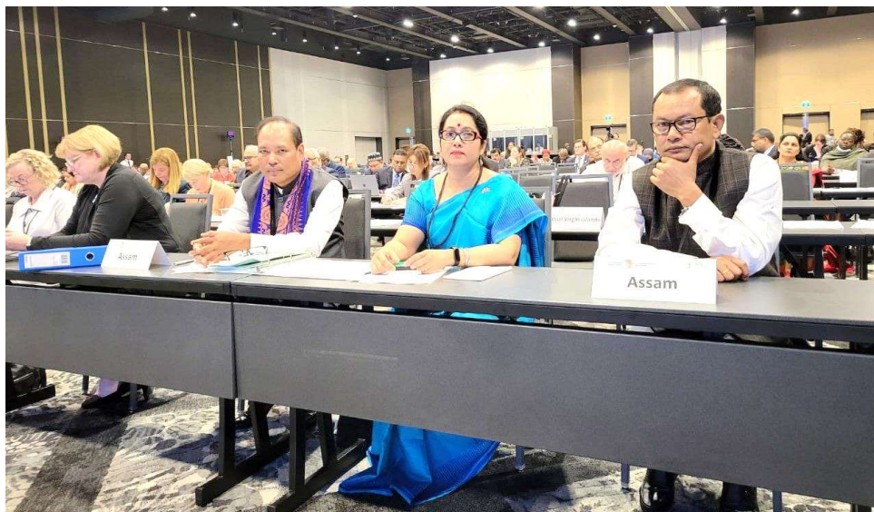
General Assembly, 65 th CPC dated 25 th August, 2022 at Halifax, Canada.