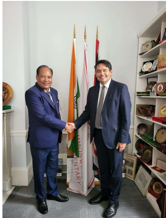
At CPA Head Quarters, London.