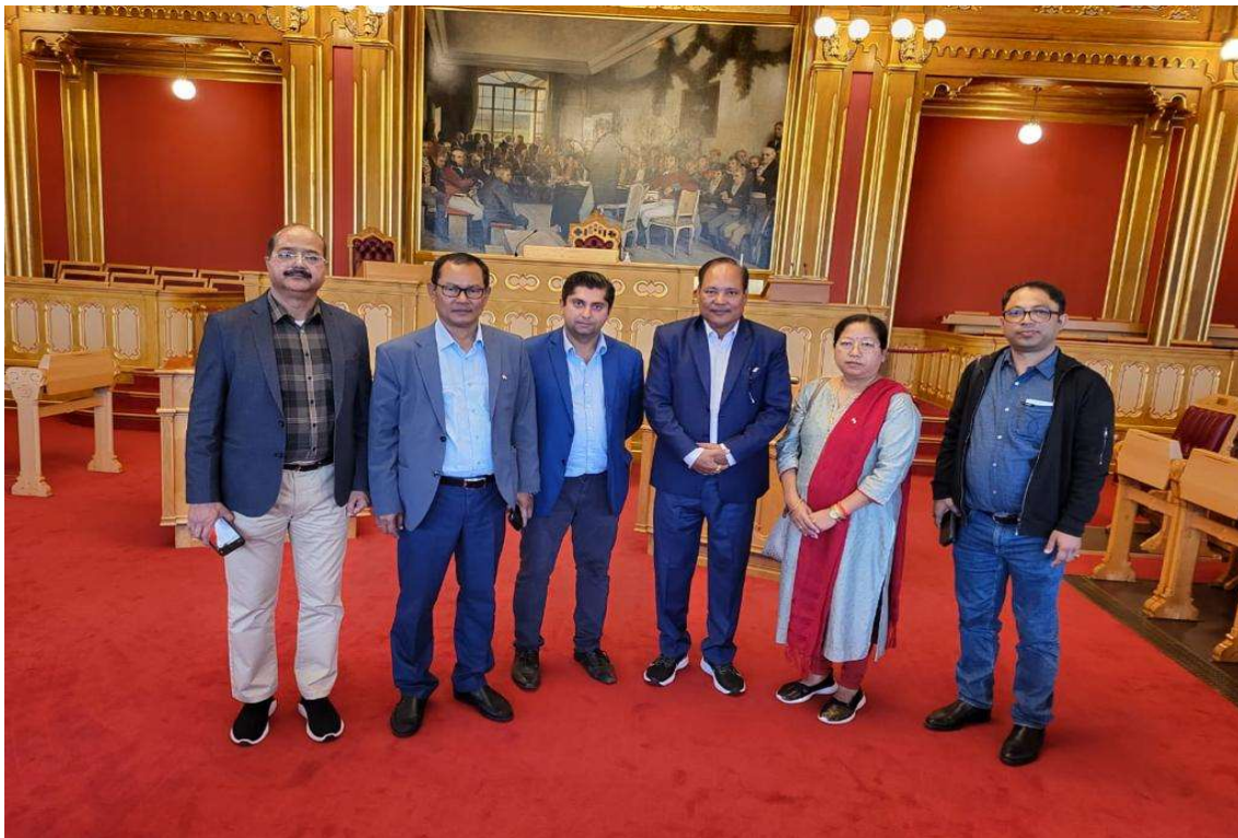
At the Parliament of Norway.