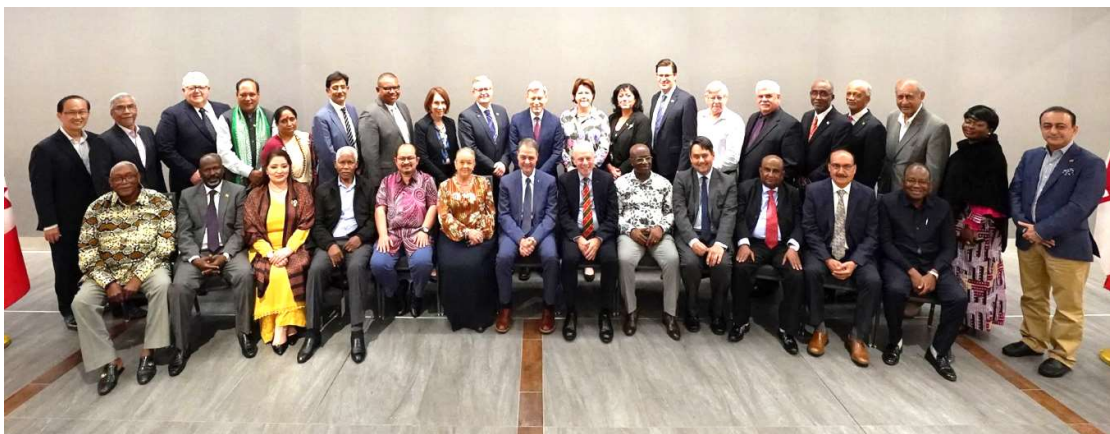
Group Photo of Executive Committee, CPA at Halifax, Canada.

event in the Commonwealth Parliamentary Association’s calendar, as it offers a unique opportunity for the representatives of the Association’s 180 Member Parliaments and Legislatures to network with colleagues from other jurisdictions and discuss common issues of concern which affect Commonwealth Parliaments.”