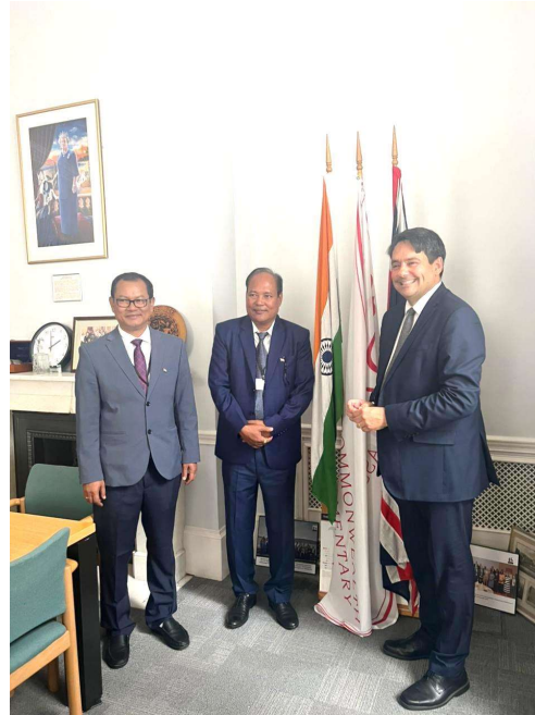
Photo taken at CPA Headquarters, London along with Secretary-General Mr. Stephen Twigg