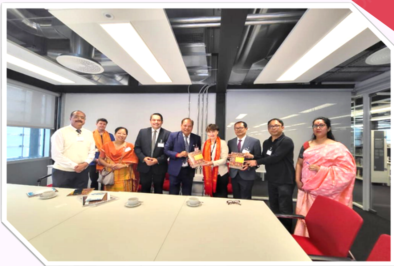
Group Photo at the British Museum, London

Social Media of Hon'ble Speaker, Assam Legislative Assembly