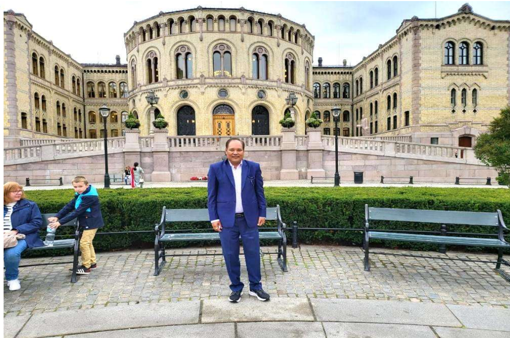
Hon'ble Speaker infront of the Norwegian Storting Building (Parliament of Norway)

The delegation also visited the Norwegian Storting Building