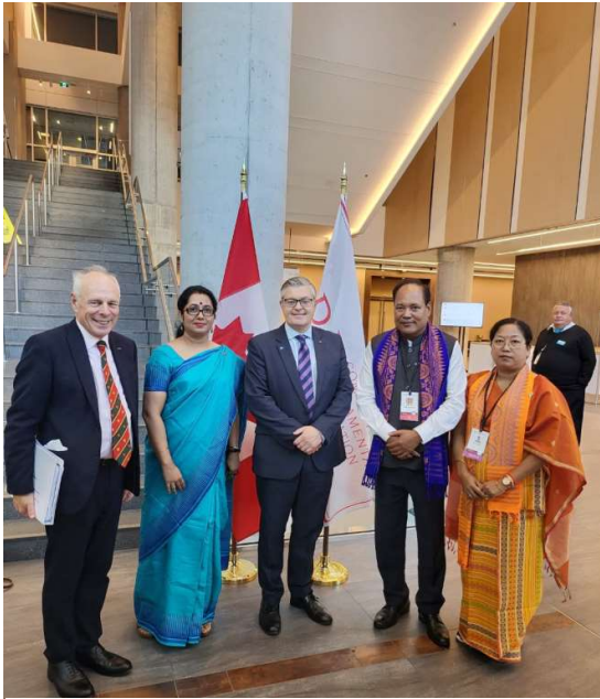
With the Chairperson, CPA at Halifax, Canada