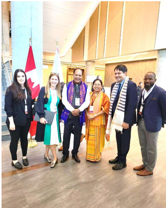
Group Photo at the Conference Venue, Halifax, Canada.